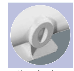
New radiator base joined by thermoelectric technology