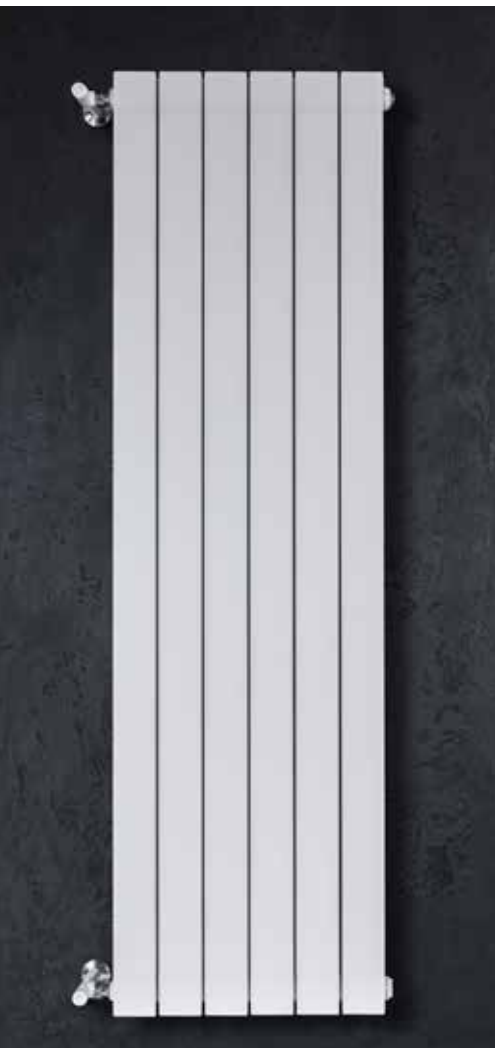
CLASSIC: NEUTRAL WHITE