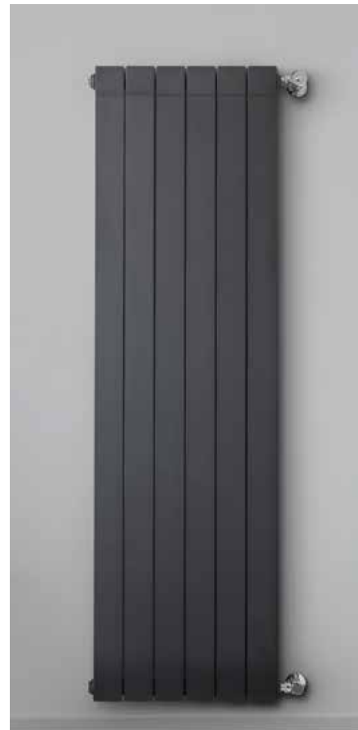
CLASSIC: BLACK COFFEE